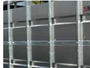
Incorporated box section for strength and reinforcement.