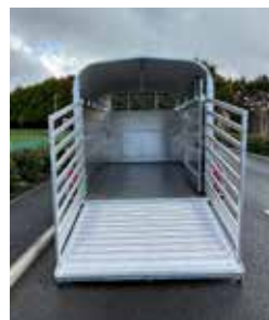
Reinforced loading ramp.