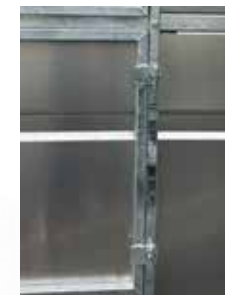
Two anti-luce pins on lower inspection door.