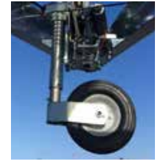
Heavy-duty jockey wheel.