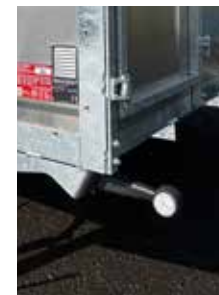
Lower rubber stalk LED marker lights.