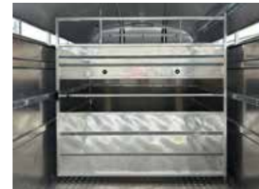
Additional dividing gate.