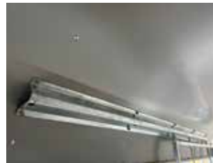
Multiple dividing gate hangers for tailored sectioning of each load.