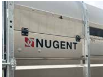
Flaps (hinge and clip system).