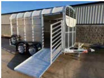
Front ramp door.