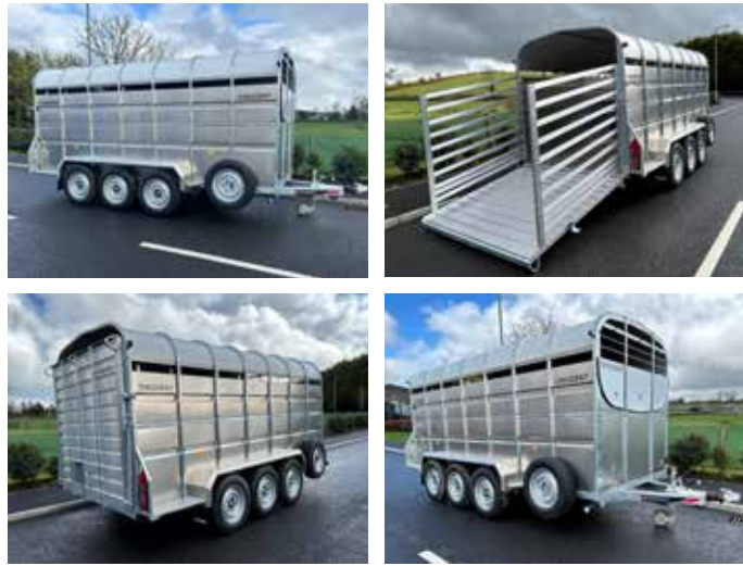
Tri axles are optional on 12 and 14 foot models and offer extra stability. Aluminium mudguards are standard on all tri-axle models.