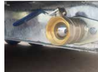
Collection tank lever valve allows for simple, safe and hygienic disposal.