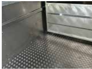
33mm timber floor with a one piece, fully sealed 2mm aluminium tread plate floor covering.