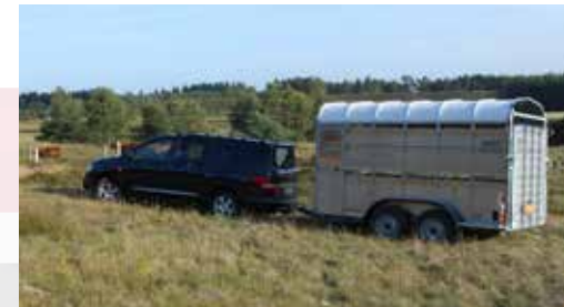
The Nugent 7 foot high option is suitable for transporting horses.