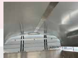
Tough central roof structure with edge retainer.