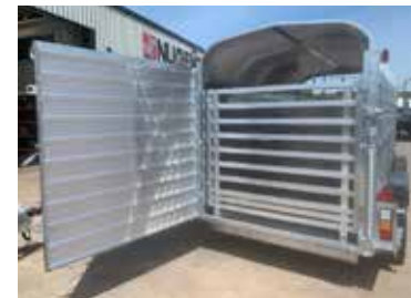
Single door. Can also be used as a ramp.