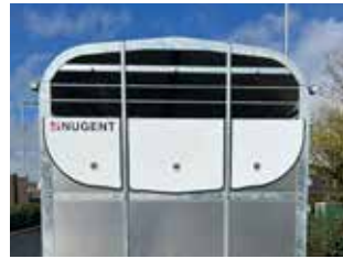
Sectional fold down front panels.