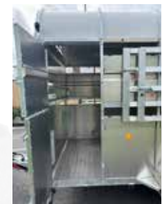
Open side door (available in both cattle & sheep trailer).