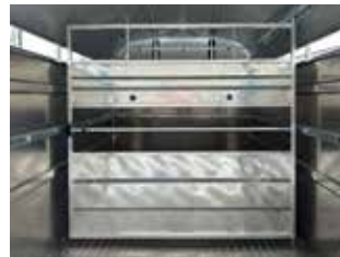
Internal dividing gate with multiple hanging locations (excluding the 8ft model).