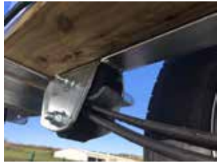
Dual Drive™ suspension.