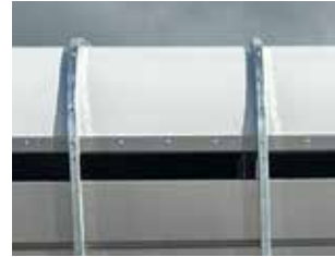
Aluminium spouting reinforces the roof.