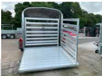
Heavy-duty loading gates.