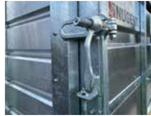
Robust taildoor fastener. Winders are simple but effective and help to strengthen the trailer when the ramp is closed.