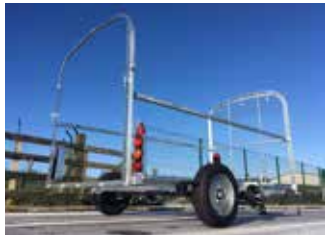
Chassis made from angle iron with a fully welded frame for maximum strength and endurance.