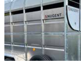
Folded sides for extra strength.