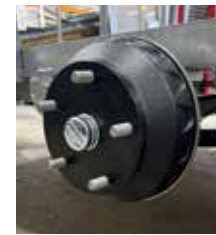
Market leading Knott brakes.