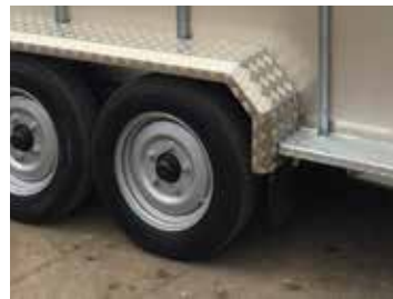
Aluminium mudguards for twin axle models.