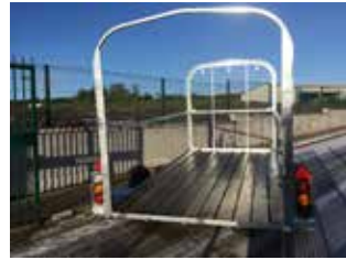
33mm preserved timber floor with aluminium treadplate for a fully sealed finish.