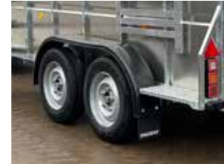
Wheels: bigger surface area tows better in fields and gives extra stability on the road. Less rolling resistance, gives a better fuel efficiency & reduces the pull on the towing vehicle.