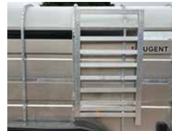
Additional pair of loading gates.