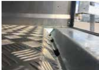
Metal collection tank designed for maximum efficiency.