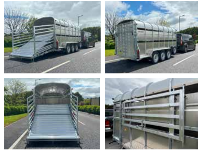
Fold-up sheep decks are conveniently and safely stowed for quick and easy access. They can be deployed without the need for any tools or special equipment. Dividing gates are supplied in both heights for when decks are in or out of use.