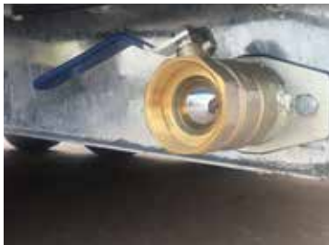
Collection tank— fully welded and sealed —hygienic disposal.